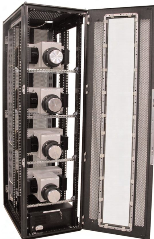
Figure 2. IDMs mounted in cabinet.